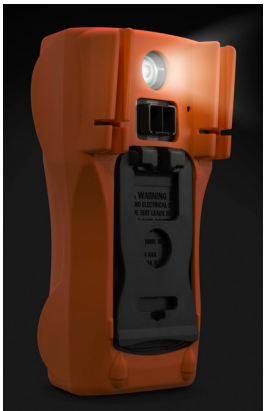
Figure 2. The built-in flashlight as illustrated