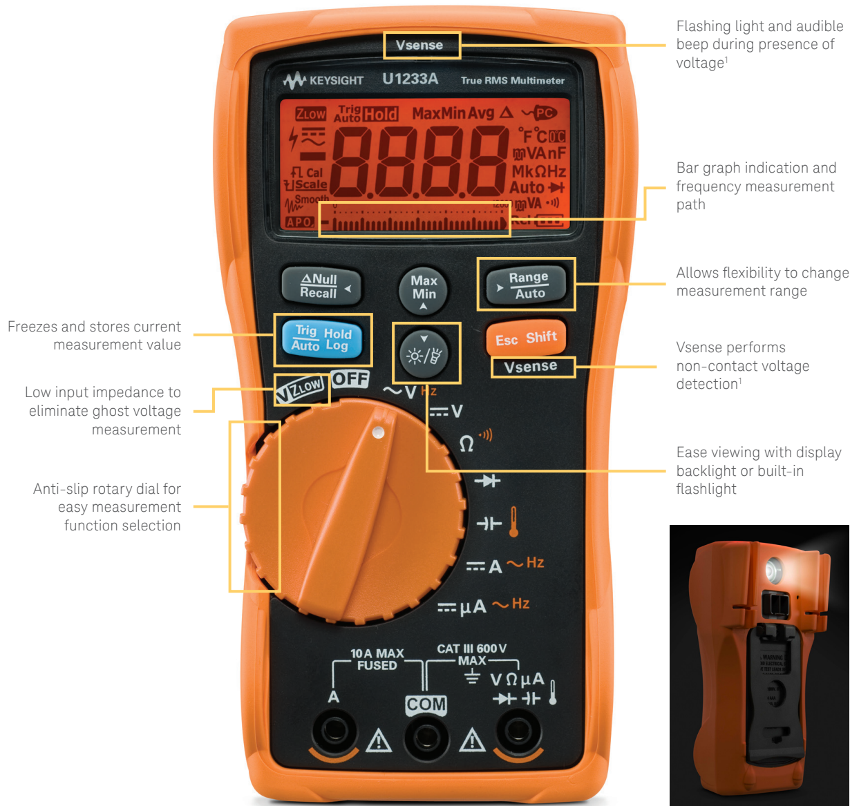
Figure 1. U1230 Series front view