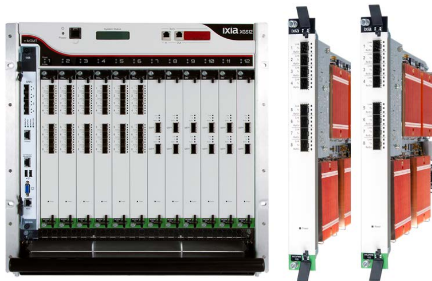
XGS12-HS chassis and PerfectStorm 10/1GE Load Modules

A single, integrated system equipped with 12 PerfectStorm blades allows control of application traffic to nearly a terabit, up to 720 million concurrent connections, and new TCP connection rates of up to 24 Million. The hardware-based acceleration supports massive encryption levels with up to 240Gbps of SSL traffic and 480Gbps of IPsec traffic per system. The system uses inline field programmable gate arrays (FPGAs) for enhanced accuracy pertaining to latency measurements with a resolution of 10ns.